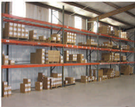
Warehousing Program Inventory

Visit our 80,000 sq. ft. facility to see how we can help you!